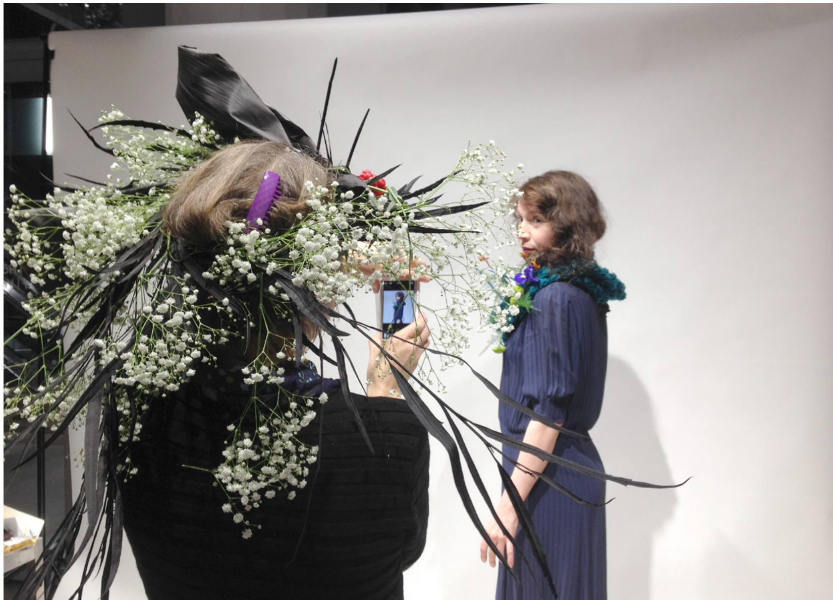
Audience takes selfies and photos of each other during the Vieno Motors performances Motors: How to Prepaire 1.0 , 2015, courtesy of Ilona Valkonen and HAM Helsinki Art Museum