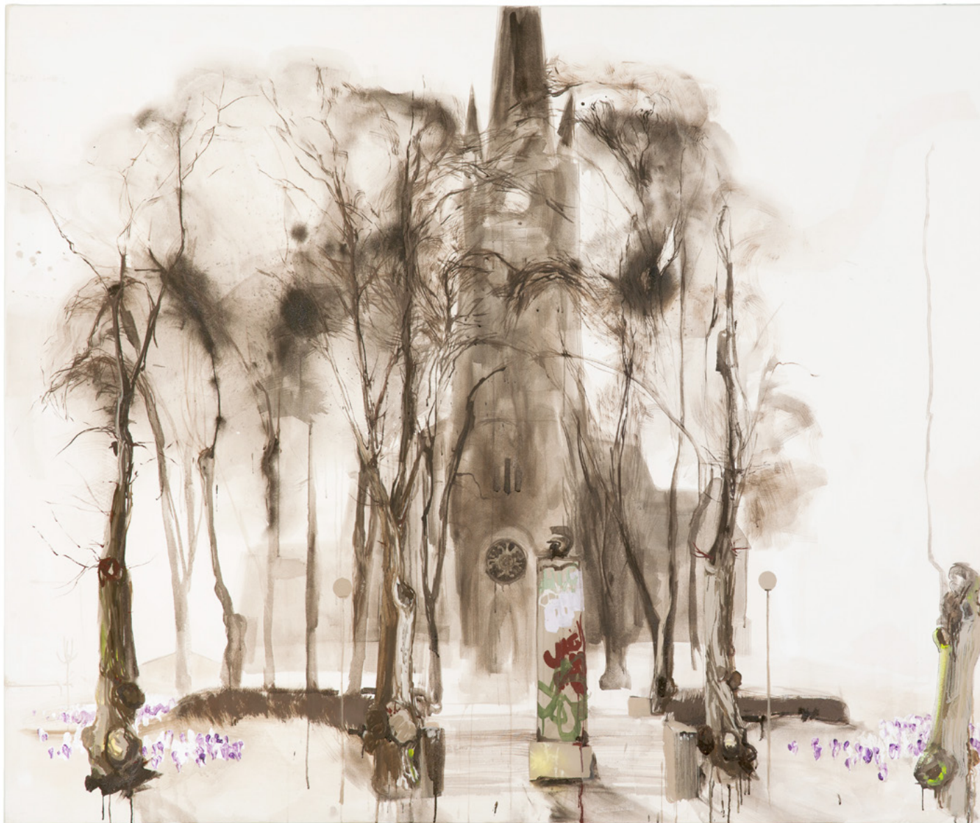
Part: Church and memorial of 8th of April, 1918 Graffiti in Arabic: Tomorrow is a better (more beautiful) day. Acryl and egg tempera and oil and alkyd on canvas, 171 x 205 cm