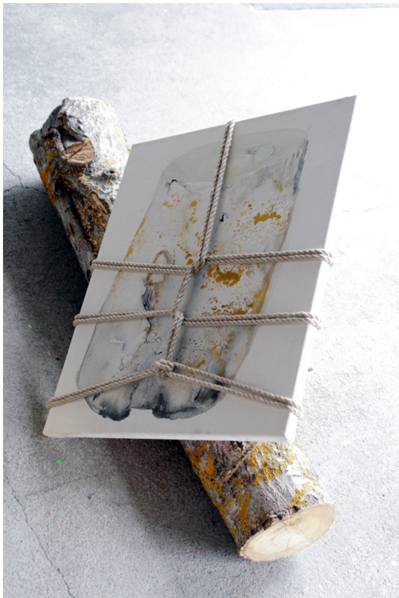
Block I-IX 2014 Bondage installation with Block painting and the log