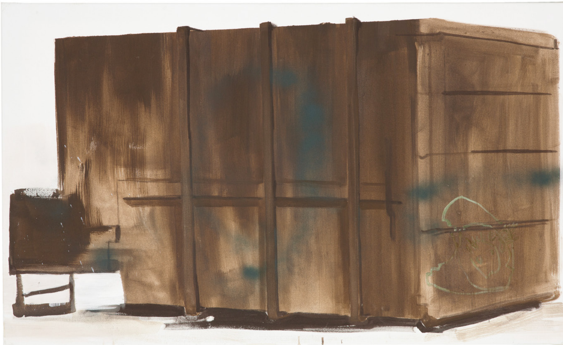
Part: Container Acryl and egg tempera and oil and alkyd on canvas, 70 x 115 cm