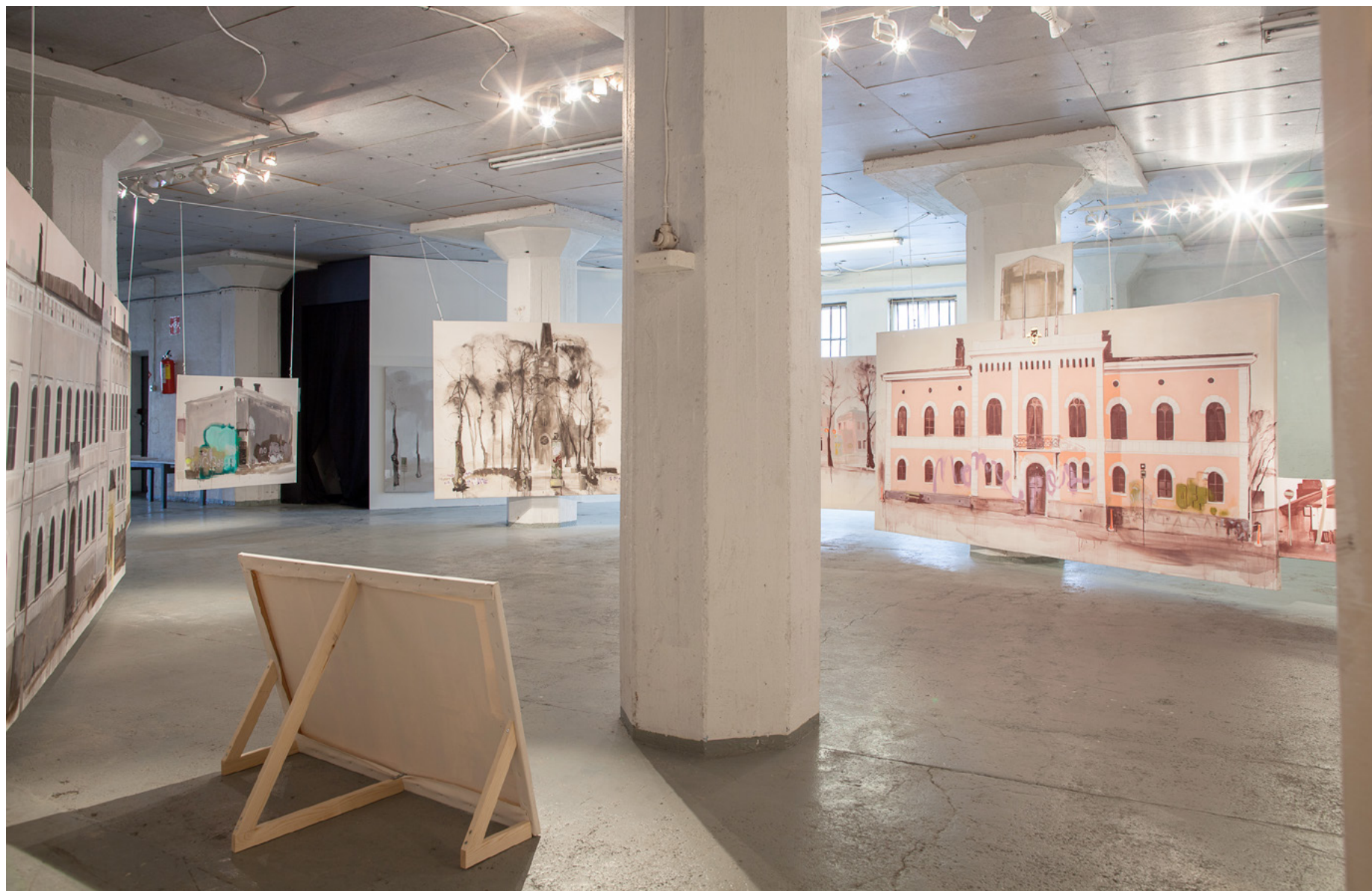
Painting installation, 30 meters long urban panorama on 22 pieces, 2013 Acryl and egg tempera, oil and alkyd on canvas; also strings, ropes and wood