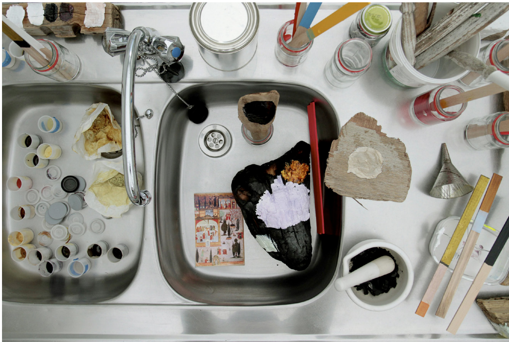
Installation details from autopsy on miniature paintings by unknown miniature painters from the 17th century Ottoman Empire. Found objects, paint, driftwood, and pigments made of plants