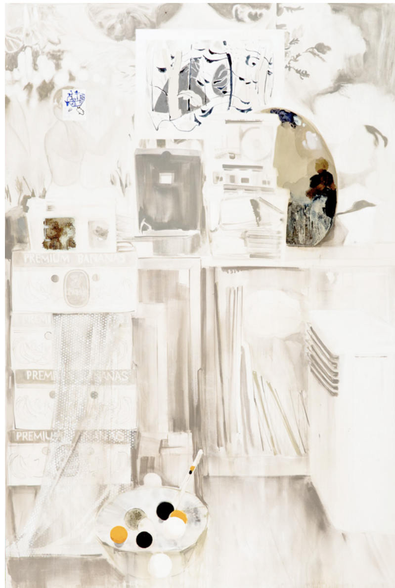
To Tove Jansson: Could I trust my notes with you until I write my memoir? 2014 oil and egg tempera on canvas, 250 x 168 cm