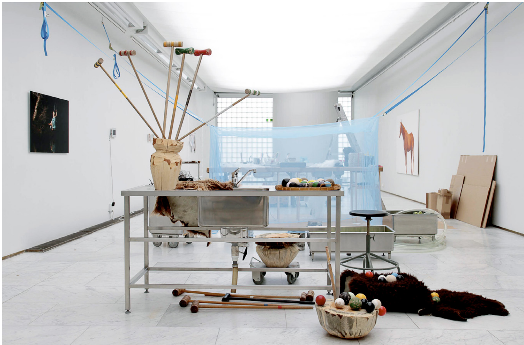
Installation details from the autopsy on Heikki Marilas Flowers ( XXIV Kukat, 2010), Wooden vases formed with chainsaw, parchments, wooden croquet mallets and balls. (left and behind: Jukka Rusanen, Swing, 2008)