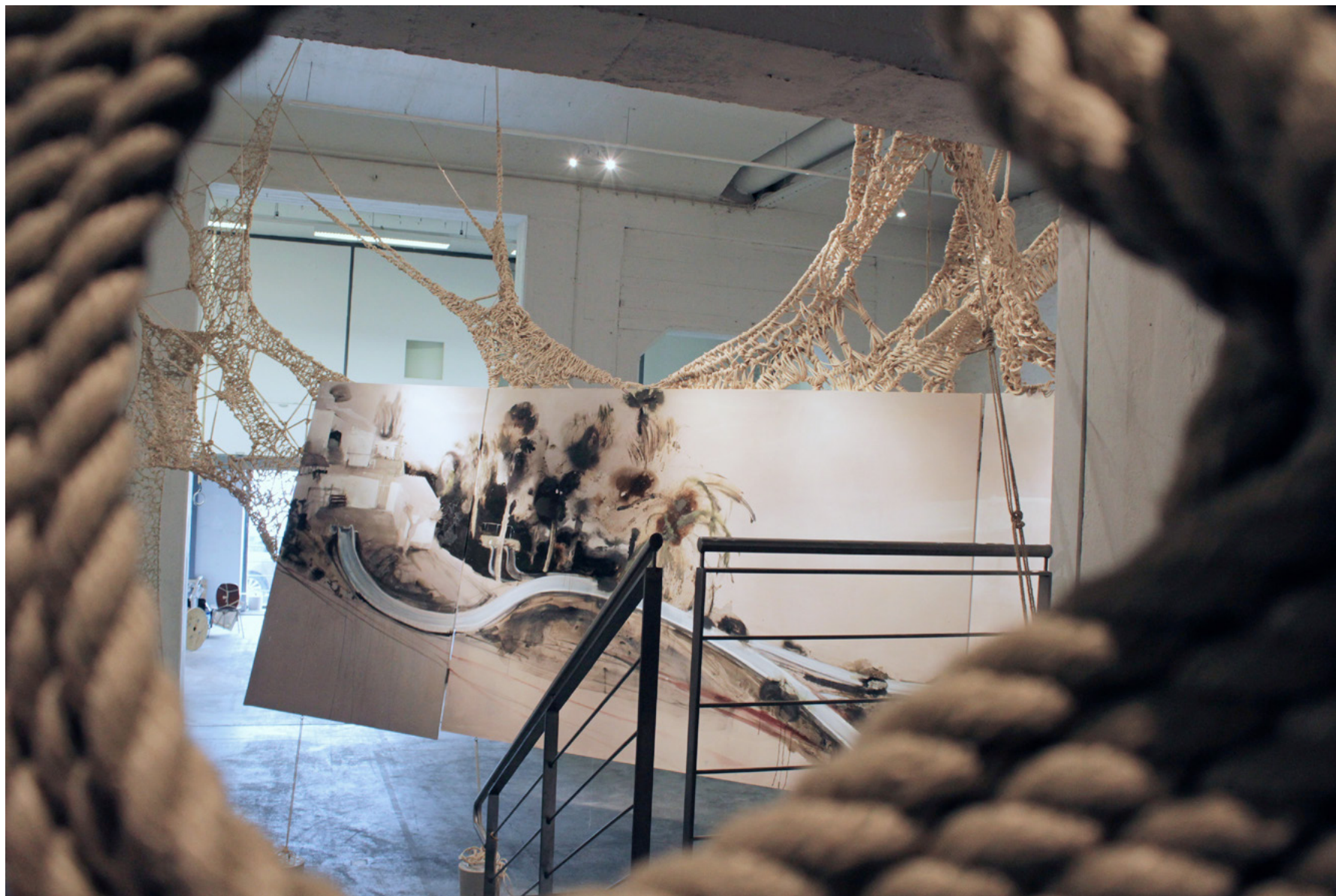
Untitled Good 2014 painting and bondage installation